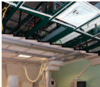
Unistrut Medical Support Systems are not visible after installation.